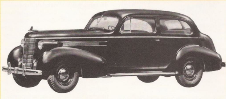
Oldsmobile's 1937 two-door touring sedan . . . "The Car That Has Everything."