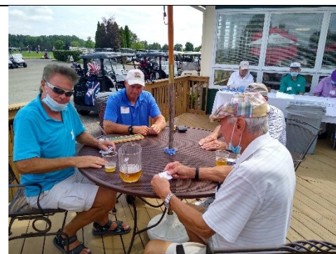
TEAM "1" SCRAMBLE WINNERS