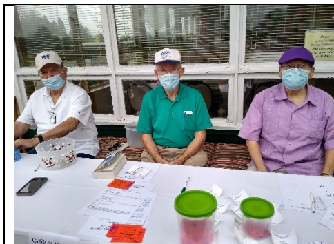
THE THREE STOOGES