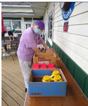
SETTING UP THE PRIZE TABLE