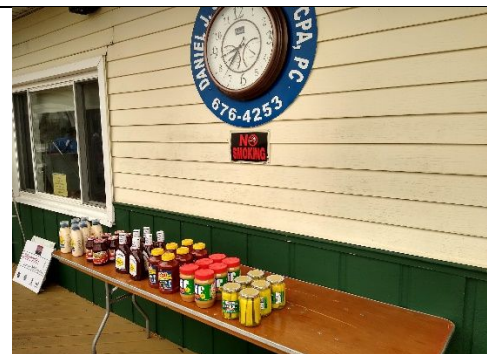
PRIZE TABLE READY TO GO