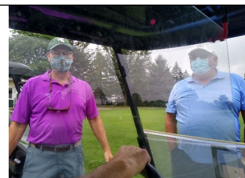
FOR SHOTGUN START